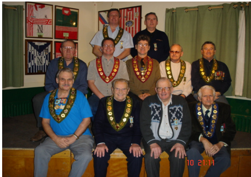
“THE GLORY BOYS OF THE MIDLAND LODGE”