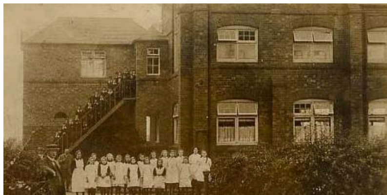
The opening of the Aldridge orphanage in 1912